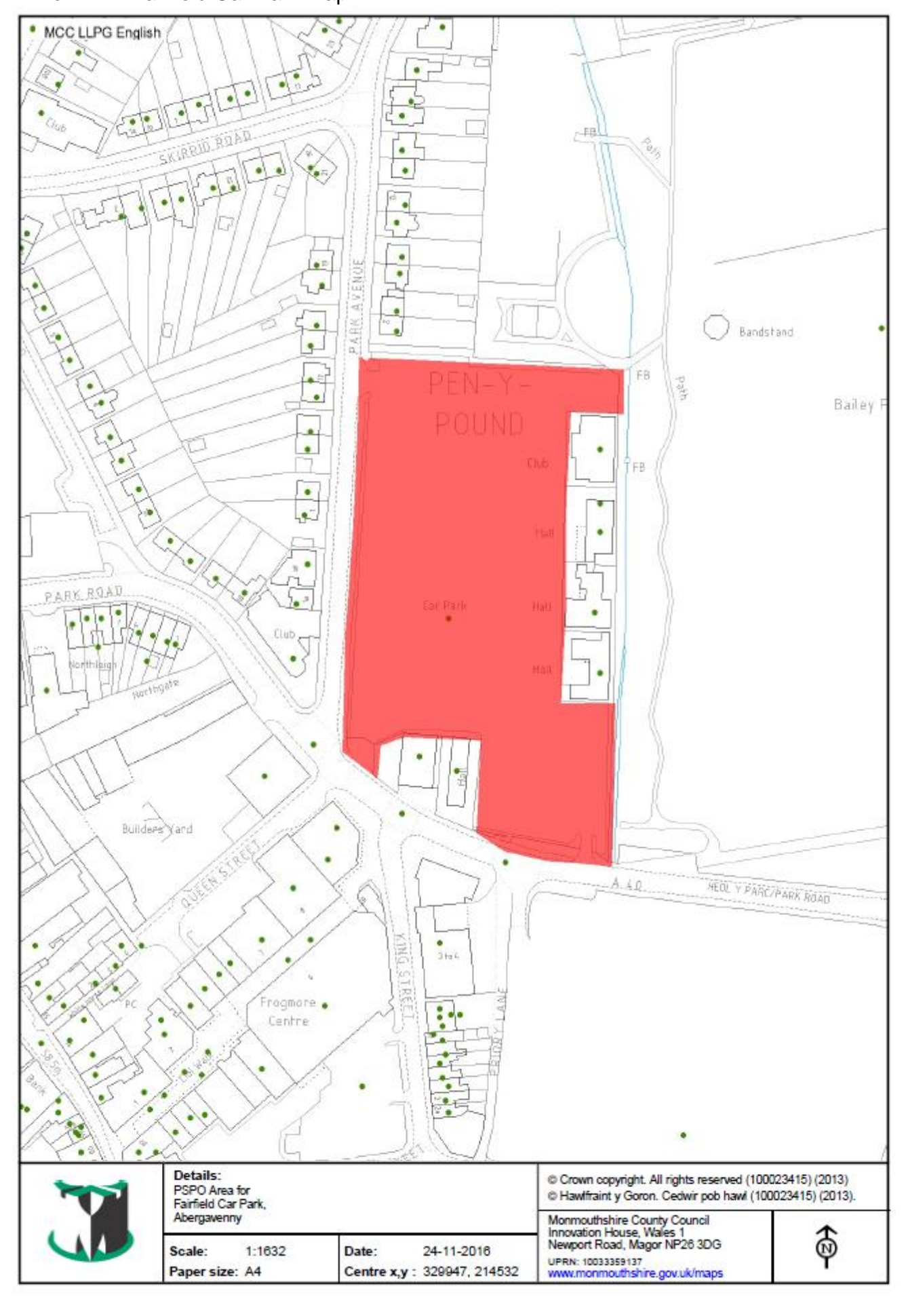
Annex A1 - Fairfield Car Park Map